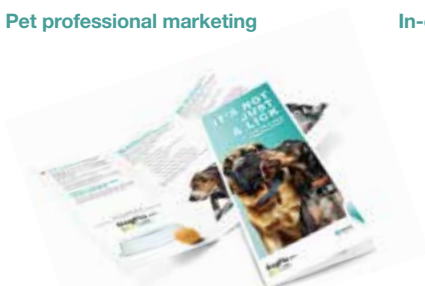
Pet owner educational materials