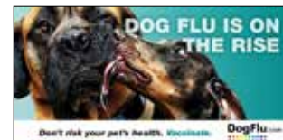
Social media assets

"[Canine Influenza] is not just a disease of the individual dog; it's a disease of the facility. If you have it at your facility...you're going to lose business and it's going to have a tremendous impact on your business."