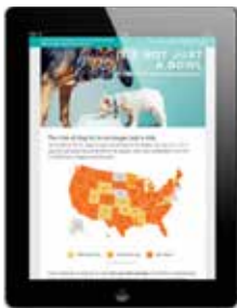
Pet professional marketing